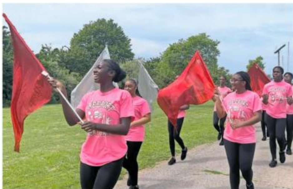
The Freeport High School color guard performed at the event.

"The success of the Spring Fling Dog Walk was a